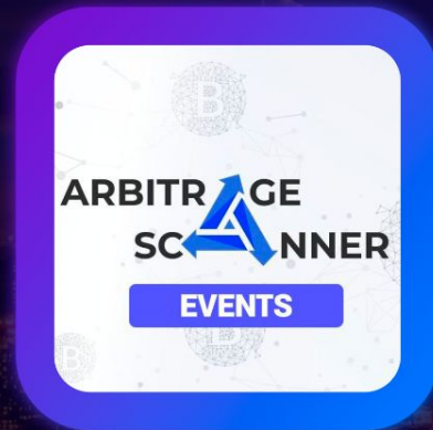
ArbitrageScanner Events Support